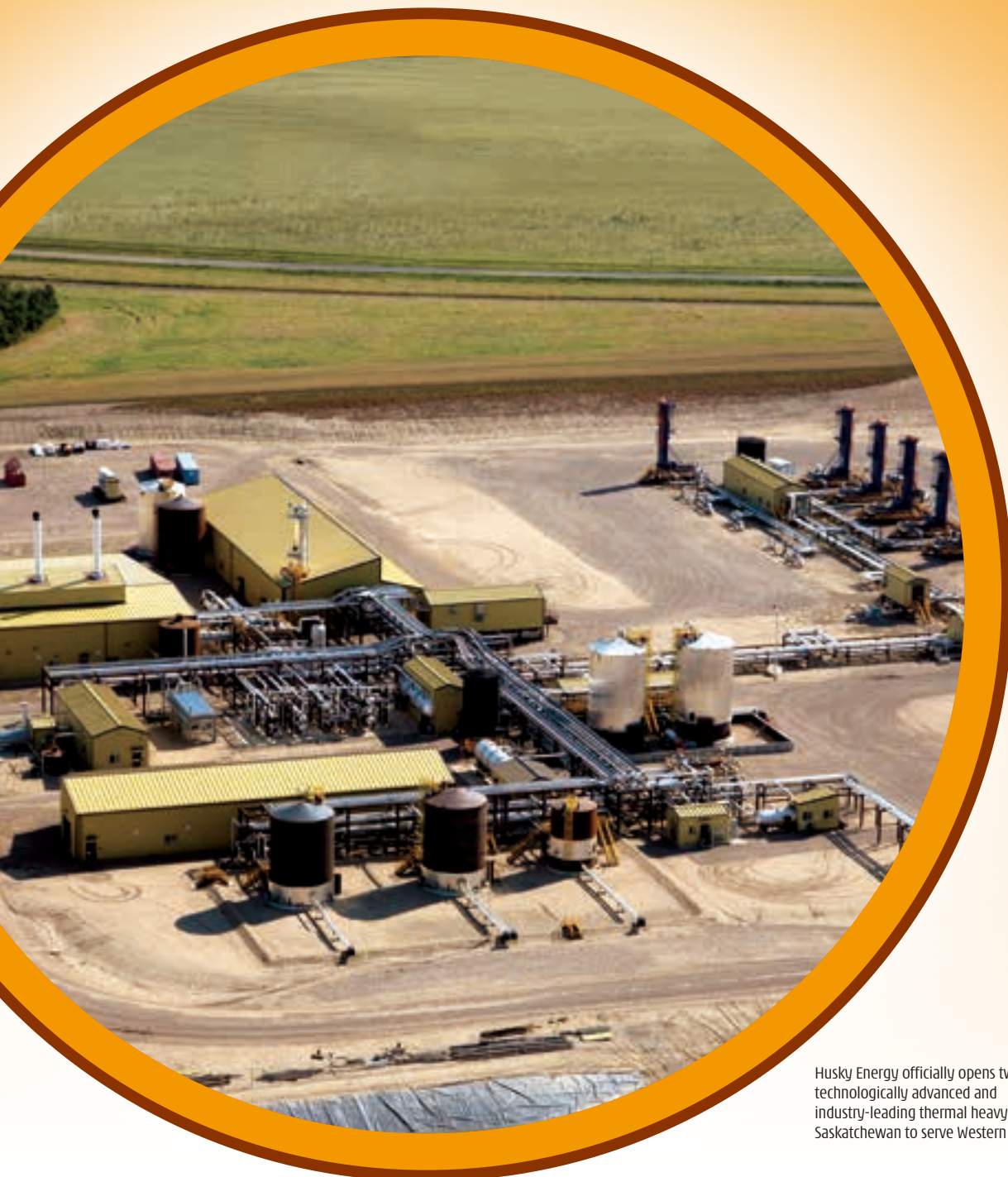
Husky Energy officially opens two technologically advanced and industry-leading thermal heavy oil plants in Saskatchewan to serve Western Canada.

The energy division comprises of the Group's 34.02% interest in Husky Energy, a Canadian based international integrated energy and energy-related company listed on the Toronto Stock Exchange.