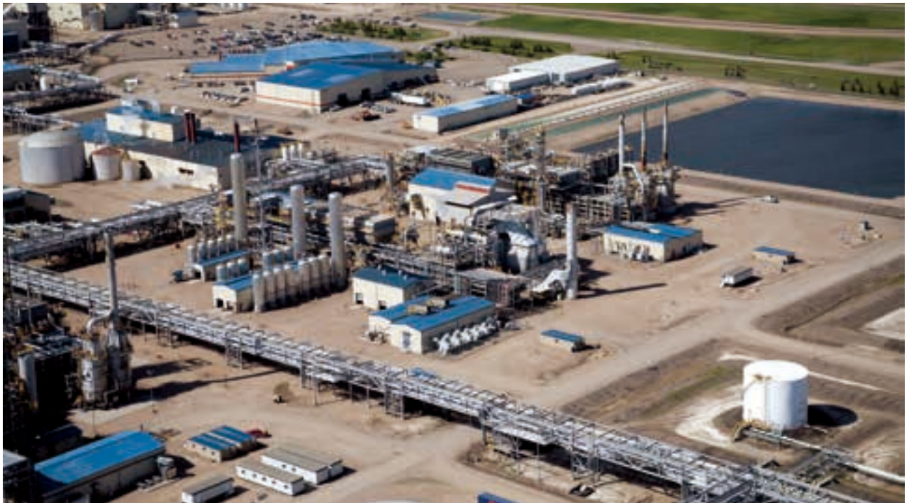
Husky Energy's Lloydminster Upgrader sets an all-time production record to convert 2.53 million barrels of synthetic crude oil from heavy oil, which can be refined into gasoline.

During 2012, Husky Energy focused on exploration and development projects on its extensive oil and liquids rich natural gas resource play portfolio in Western Canada and continued development of heavy oil thermal projects as well as major growth projects in Asia Pacific, the Oil Sands, and the Atlantic Region. First oil was achieved during the second quarter of 2012, ahead of schedule, for the 8,000 barrels per day capacity Pikes Peak South and 3,000 barrels per day capacity Paradise Hill thermal project respectively and production in the fourth quarter reached a combined 17,000 barrels per day. The Liwan Gas Project in the South China Sea is now more than 80% complete and currently planned to be on track to achieve planned first production in late 2013 / early 2014. Four new gas discoveries on the Madura Strait Block, offshore Indonesia, are being evaluated for potential tie-in to existing nearby infrastructure. At the Sunrise Energy Project, substantial cost certainty related to the first phase of the development was achieved in 2012 with the conversion of the lump sum contract for the Central Processing Facility. In the Atlantic Region, work continued in anticipation of sanction of the South White Rose Extension project with first oil expected in 2014 and development concepts, including a wellhead platform, are being evaluated for the West White Rose extension project in anticipation of production in the 2016 timeframe.