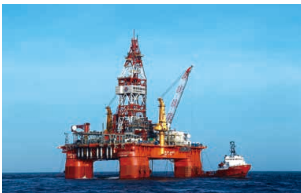
A new drilling rig built by China Oil Field Services Limited is mobilised to support the Liwan Gas Project.

In 2012, Husky Energy's production averaged approximately 301,500 barrels of oil equivalent ("BOEs") per day, a 4% decrease when compared to approximately 312,500 BOEs per day in 2011, primarily due to the planned Atlantic Region off-station maintenance programs on the SeaRose and Terra Nova Floating, Production, Storage and Offloading vessels completed during 2012 and a reduction in natural gas production as investment prioritised higher netback crude oil and liquids rich natural gas developments. Declines were partially offset by the start-up of two new heavy oil thermal projects at Pikes Peak South and Paradise Hill. Crude oil and natural gas liquids production was 209,200 barrels per day in 2012 compared with 211,300 barrels per day in 2011. Natural gas production was 554 million cubic feet per day in 2012, compared with 607 million cubic feet per day in 2011.